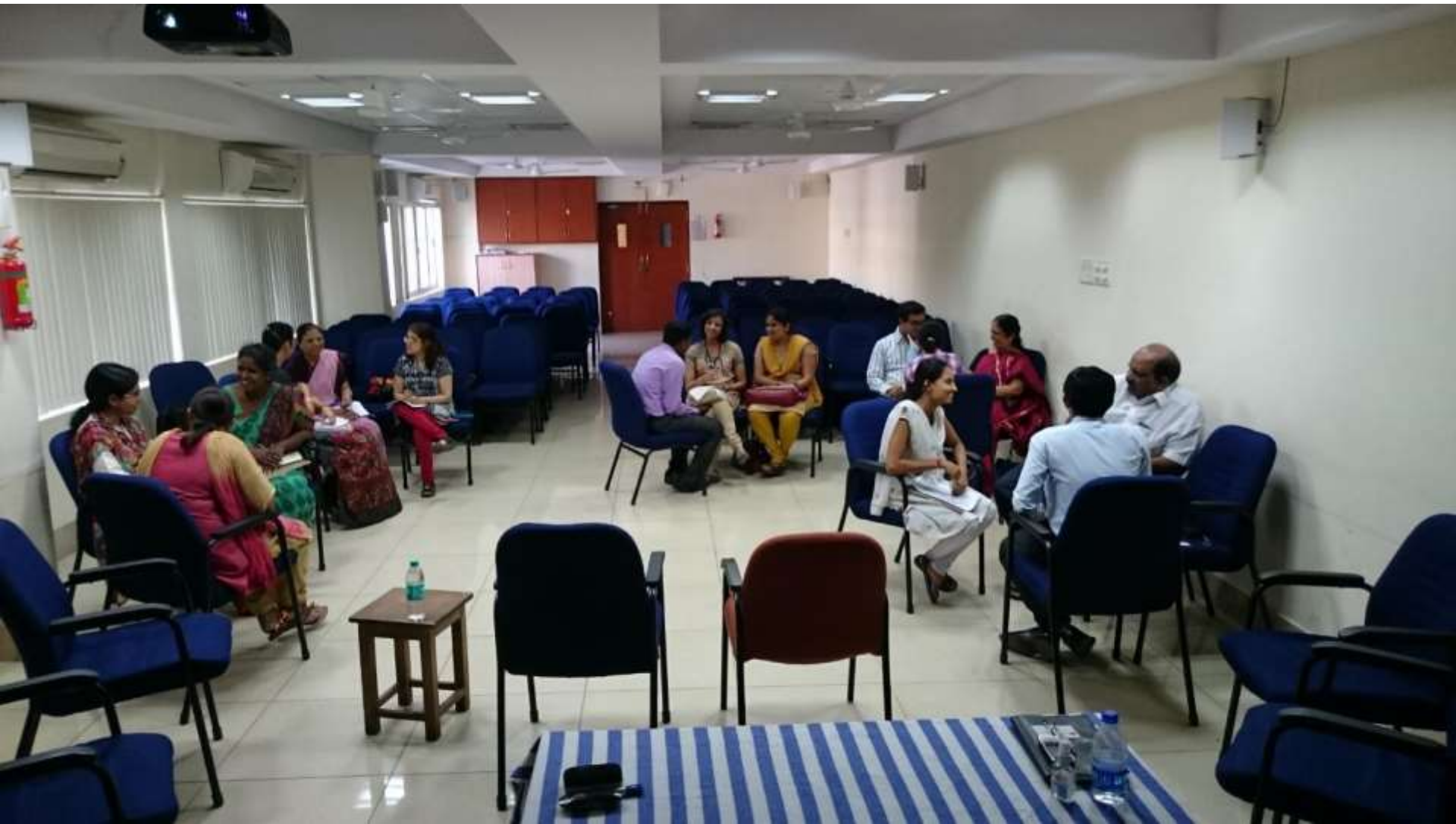
Small group work