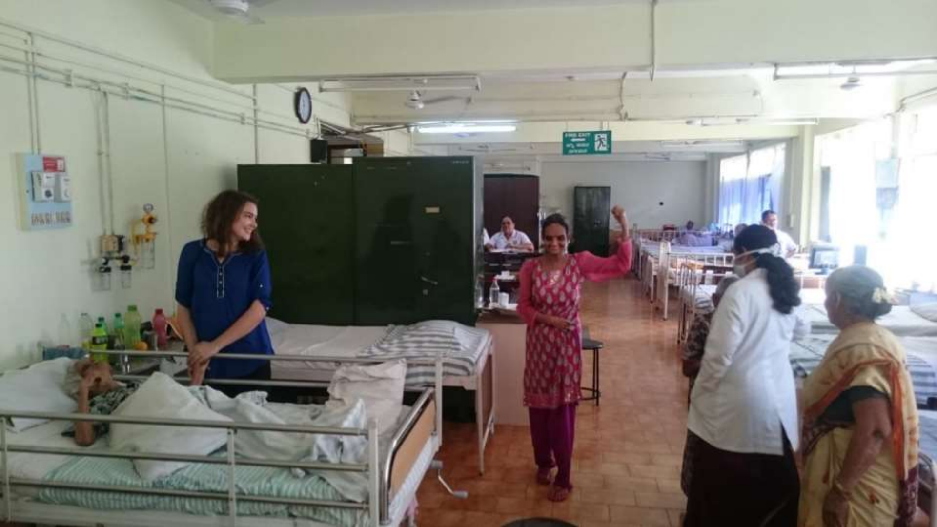
Psychodrama at the ward