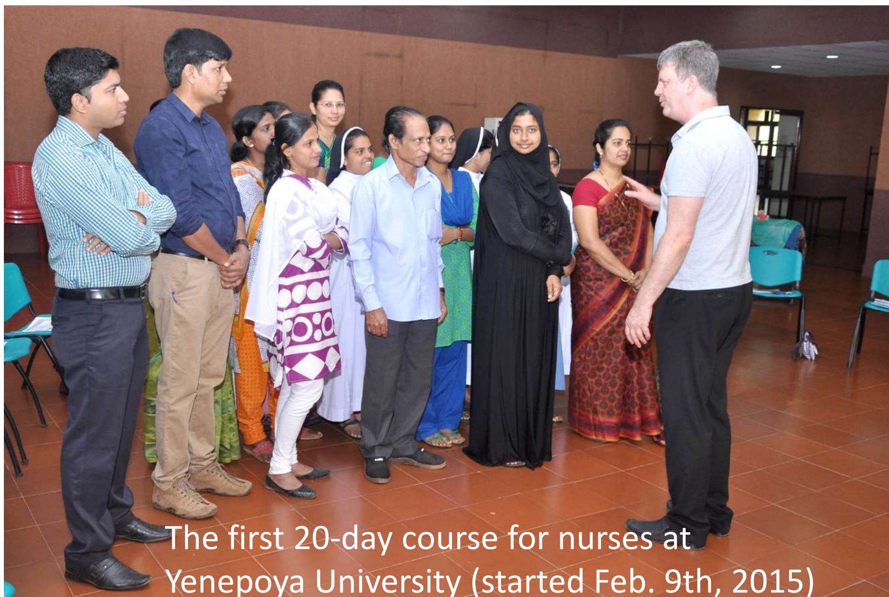
The first 20-day course for nurses at Yenepoya University (started Feb. 9th, 2015)