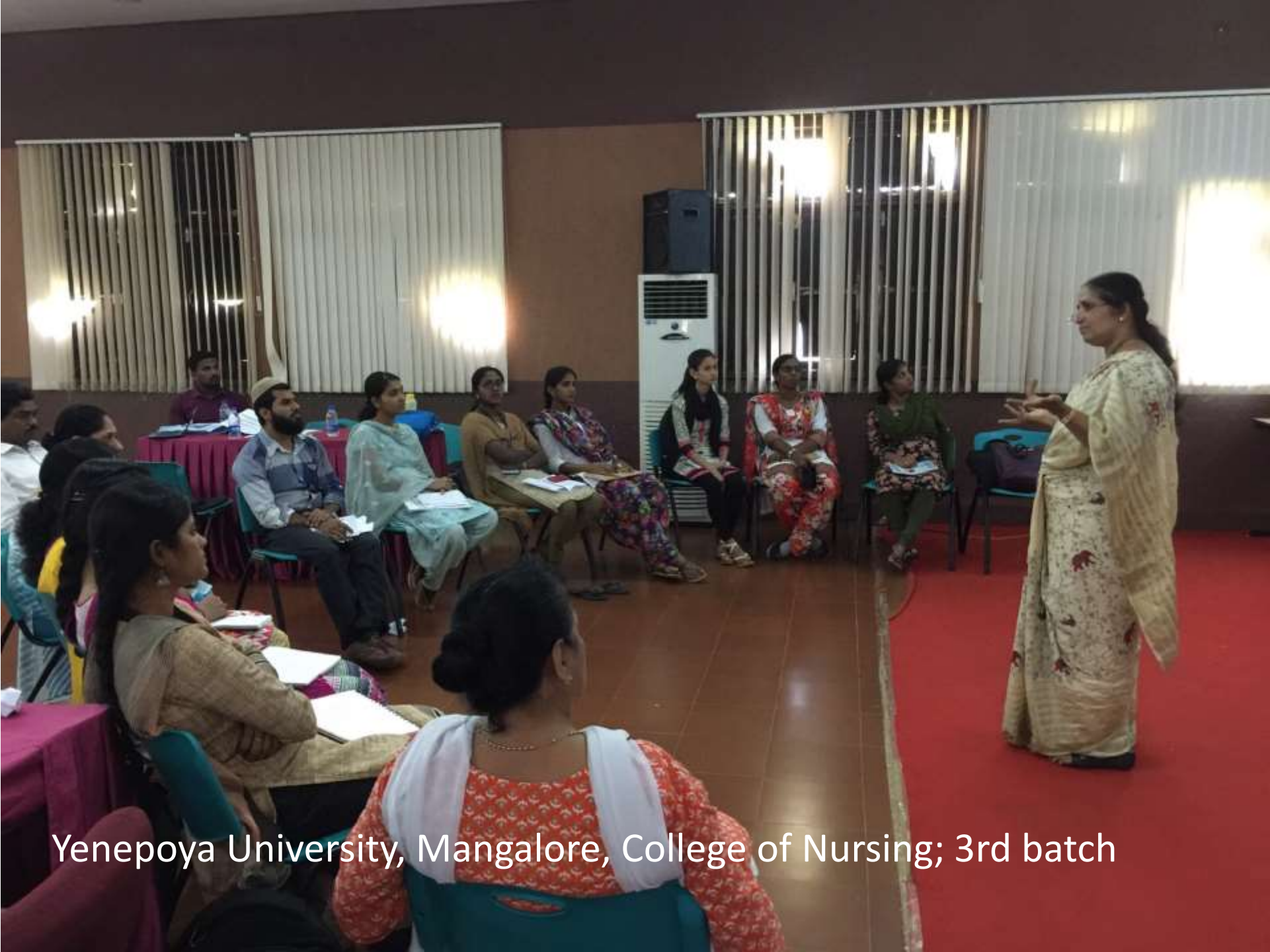
Yenepoya University, Mangalore, College of Nursing; 3rd batch