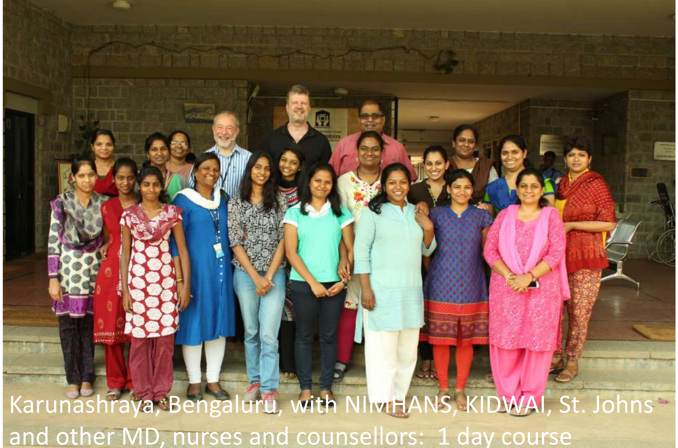
Karunashraya, Bengaluru, with NIMHANS, KIDWAI, St. Johns and other MD, nurses and counsellors: 1 day course