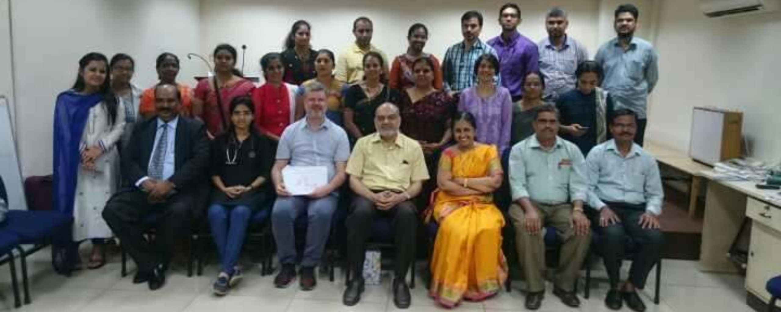
KMC Attavar, Mangalore, Manipal University 3rd batch